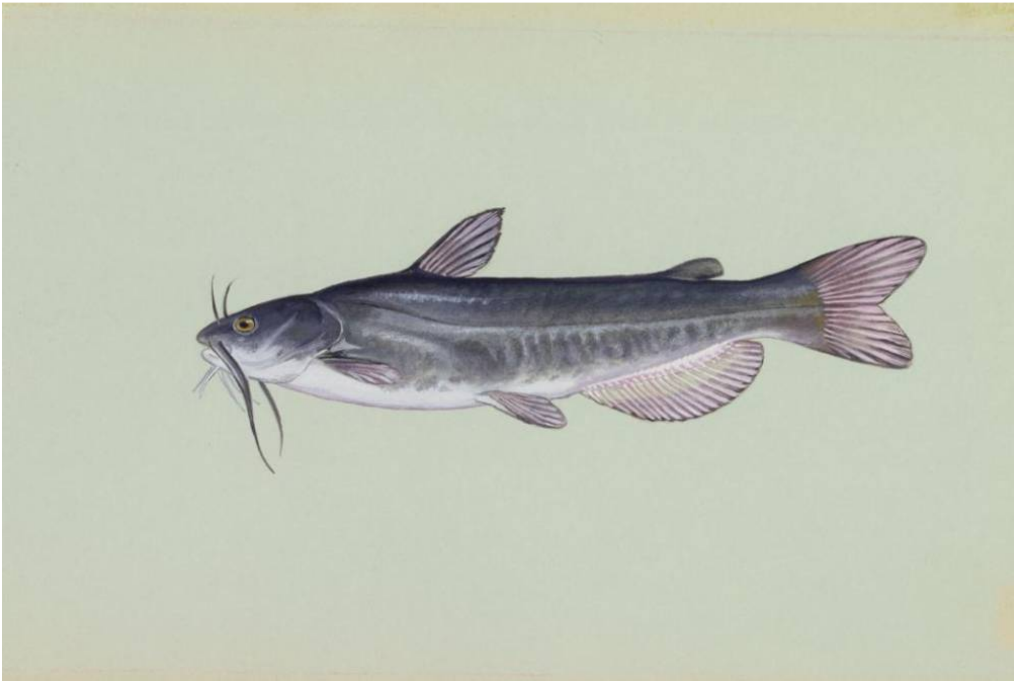
Ameiurus catus Photographer: Duane Raver Credit: U. S. Fish and Wildlife Service Source: http://images.fws.gov/ Permissions for Use: See here .