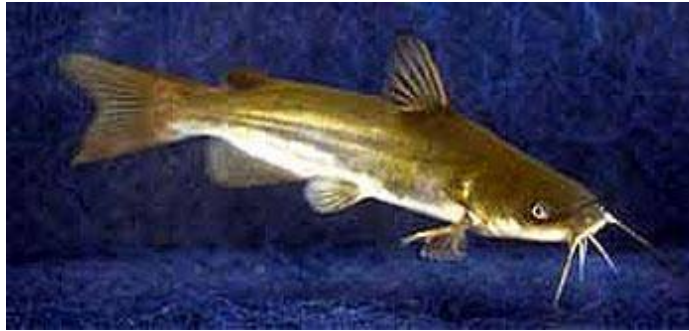
Unsexed specimen of Ameiurus catus