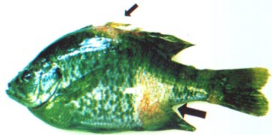
Figure 1. Lesions typical of red sore disease. Small, red raised ulcers present on tips of dorsal fin rays (small arrow.) Large ulcer on side of body (large arrow).

In its mildest form, the condition is seen as red, raised "sores," or lesions, on the tips of fins, particularly the dorsal fin of bluegill (Figure 1). As the disease progresses, fish may be afflicted with fin erosion, and ulcers on the side of their body (Figure 1). Because red sore disease is a general condition rather than a specific disease, affected fish must be sent to a fish disease diagnostic laboratory in order to correctly identify the pathogens contributing to each outbreak of disease.